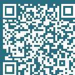
CONCURRENT SESSION PRESENTERS AND FACILITATORS