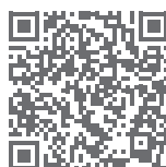
Peer Session Agendas

Peer sessions offer staff and council members the opportunity to network and exchange ideas within job-alike groups. Meeting agendas, developed by volunteer coordinating teams, are available at the NASAA registration desk, or scan the QR code above.