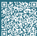
DINING & ATTRACTIONS