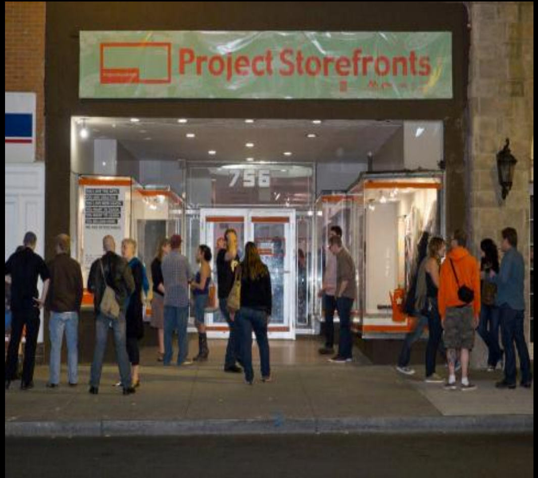
AFTER May 2012