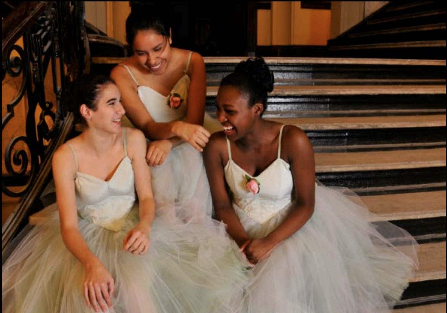
The Stamford School of Ballet located in the Stamford Innovation Center