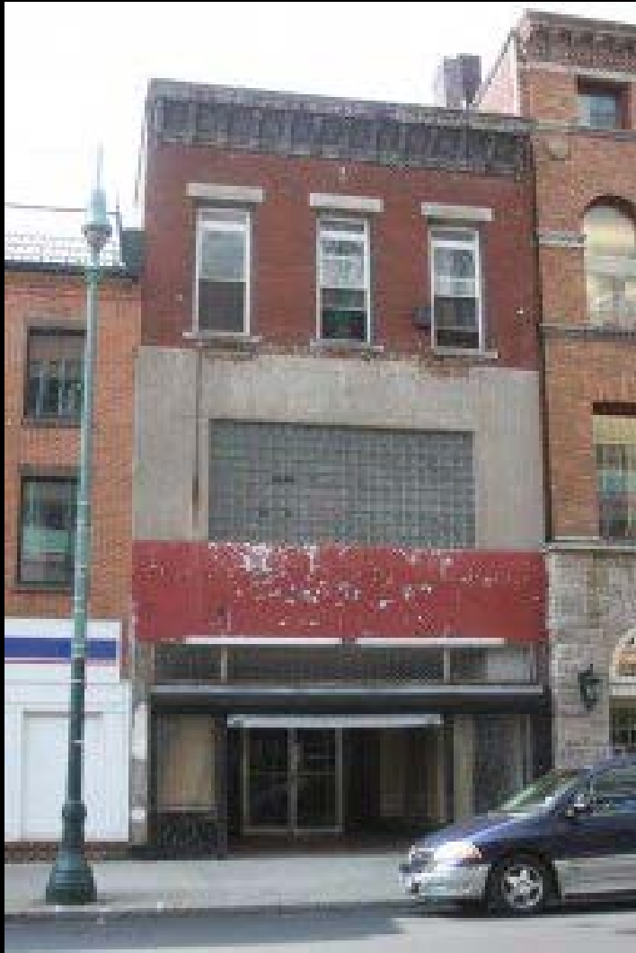
BEFORE July 2011