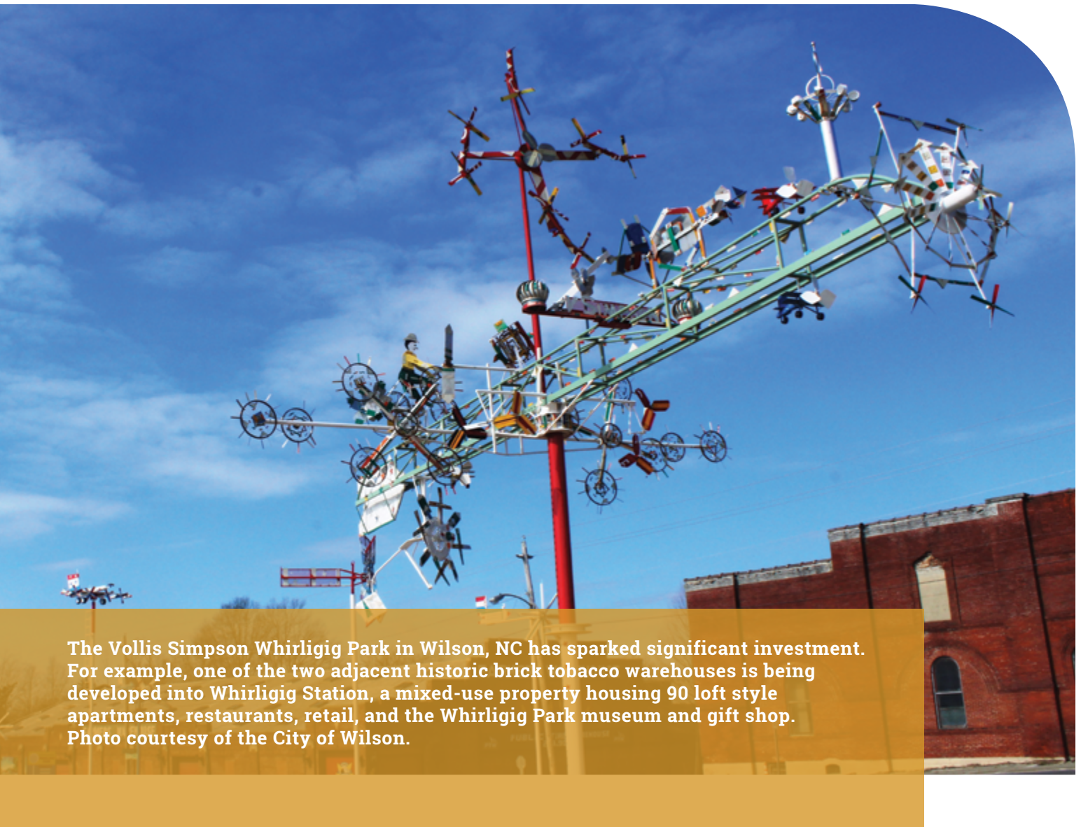
The Vollis Simpson Whirligig Park in Wilson, NC has sparked significant investment. For example, one of the two adjacent historic brick tobacco warehouses is being developed into Whirligig Station, a mixed-use property housing 90 loft style apartments, restaurants, retail, and the Whirligig Park museum and gift shop.

local leaders to develop solutions for tough problems facing small towns. The issues include building strong economies, planning for growth and redevelopment, improving transportation systems, and protecting historic and culturally significant resources.