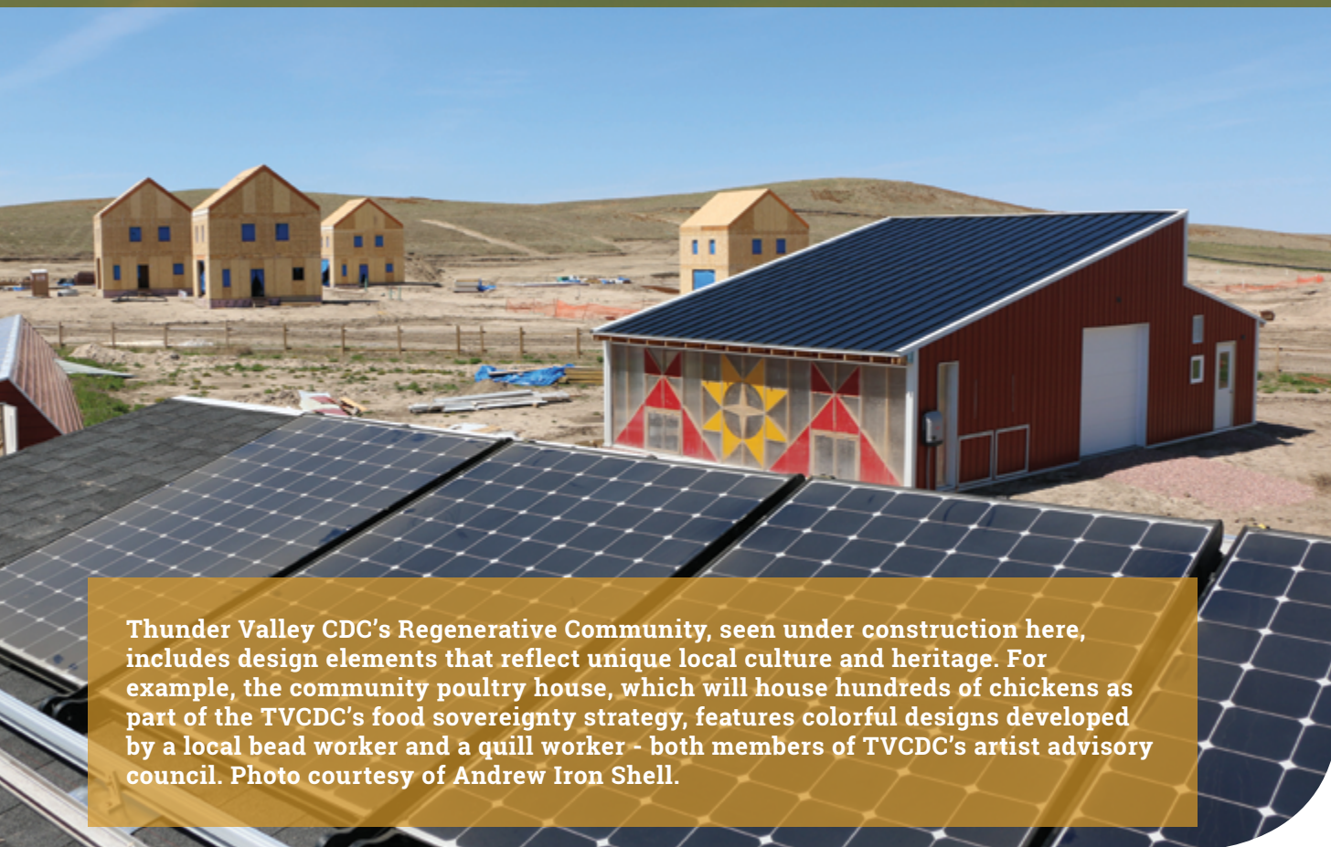
Thunder Valley CDC's Regenerative Community, seen under construction here, includes design elements that reflect unique local culture and heritage. For example, the community poultry house, which will house hundreds of chickens as part of the TVCDC's food sovereignty strategy, features colorful designs developed by a local bead worker and a quill worker - both members of TVCDC's artist advisory council.

I have had the honor and pleasure of serving the National Endowment for the Arts (NEA) since January 2011, most recently as Acting Director of Creative Placemaking and Design Programs. One of the things I learned early in my time and that continues to impress me is how much this agency does for America's rural communities. In fact, 22.8 percent of NEA funding goes to small-metropolitan and rural places, a percentage in line with the 23 percent of Americans who live in those communities.