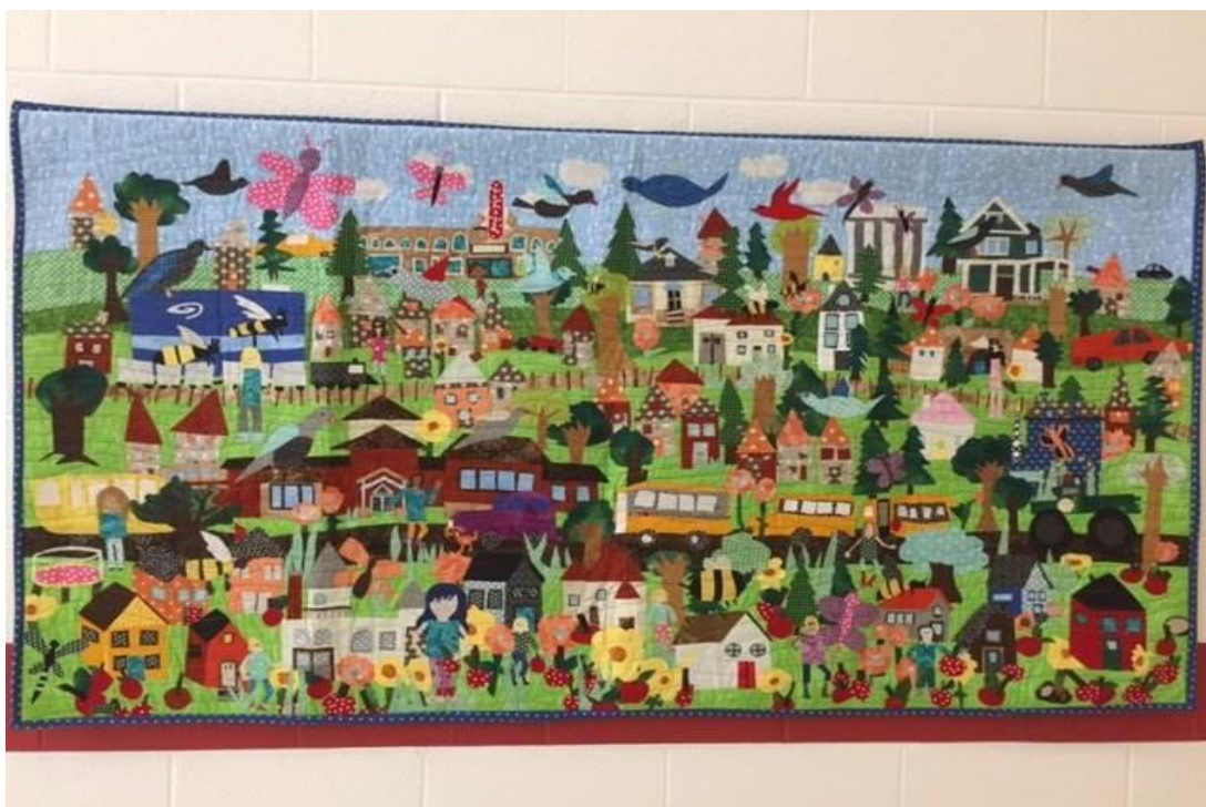
Garfield Elementary quilt