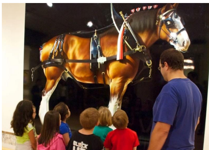
Students at the Butler Institute of American Art

The Southern Ohio Museum and Cultural Center (SOMACC) collaborated with Western Local Elementary School (WLES) in rural Pike County to provide a thematic learning experience focusing on local history, specifically early Native Americans. The residency took place during the 2015-2016 and 2016-2017 school years. Fourth grade students study Ohio history as a component of the state academic standards and the museum houses a significant collection of ancient Hopewell and Adena artifacts. The curriculum focus and museum collection combined with access to historic murals along the floodwalls and local Native American musicians, made for a natural collaboration.