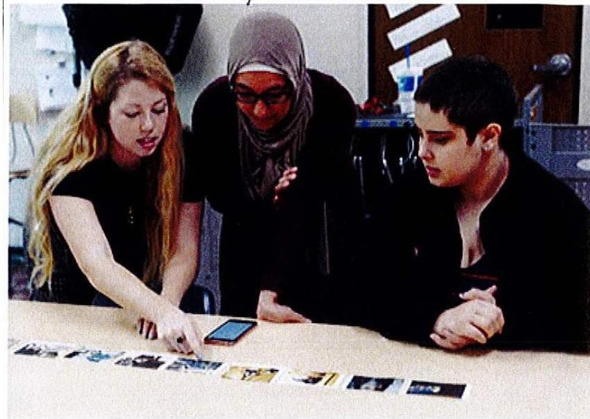
Students critiquing photographs

story after critiques and their deep interest in completing the story. Also, the social, creative, artistic and technical aspects associated with the creation of photography were successfully incorporated into the storytelling process. This helped each student focus their efforts on a specific topic — the purpose of their story. Because of this, the act of returning to the same people and the same environments multiple times served as a learning incubator. Each experience revealed new opportunities and through group edits in class, and the instruction from those edits, the students began to recognize the opportunities available to them.”