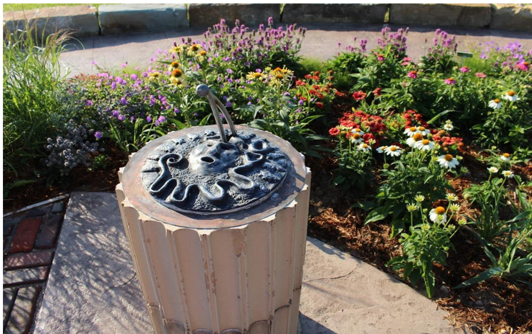
Human Rights Garden detail – cast sundial