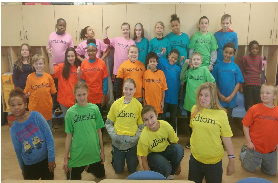
Starling K-8 Language Arts Class

Graham Elementary is in rural Champaign County where students do not have ready access to arts resources. Neither do they have an art teacher. Therefore, the staff were eager to explore arts learning through TeachArtsOhio .