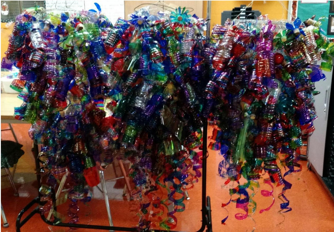
Chihuly style “chandeliers” waiting to be hung in the media room at Graham Elementary