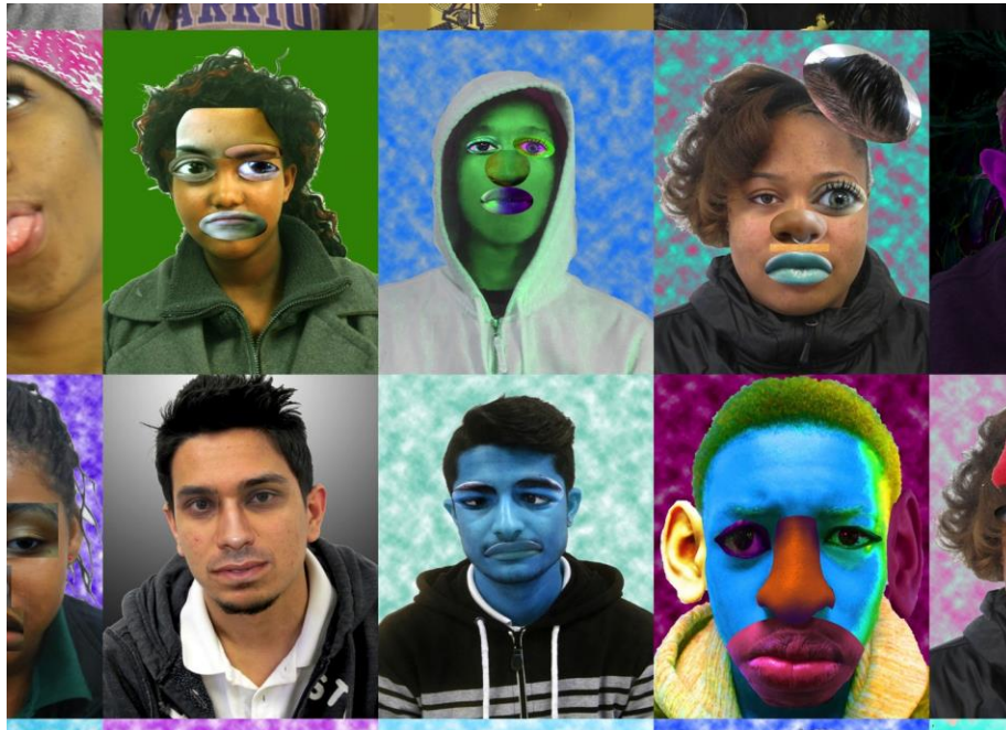
Winton Woods Student Photo Montage