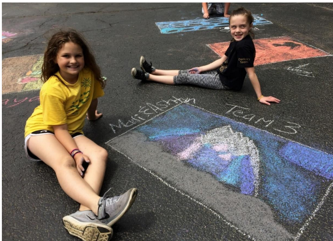
Triad Elementary Field Day Chalk Art Challenge