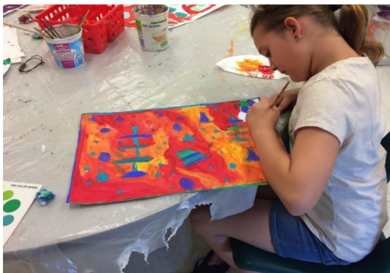
Triad Elementary Student Painting

She saw many positive impacts on students. In her words, "They may not always remember which color is a secondary color but they have come to understand that 'mistakes in art can be fixed' or as we discussed, that art gives you an opportunity to revise, to go in a new direction, to discover something new and that there is no correct answer necessarily when one is creating a work of art. Elliot Eisner (referencing John Dewey) refers to this as 'flexible purposing' where a set of conditions offers a whole set of possibilities from which to choose and each choice leads to a new possibility. In a school setting which must focus on testing and the 'right answer,' this type of experience is like a gift, for all students, but especially for students who are not always the best test takers but who are observant, reflective creative thinkers."