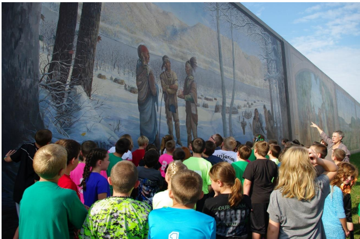
Western Local Students visit the flood wall murals.