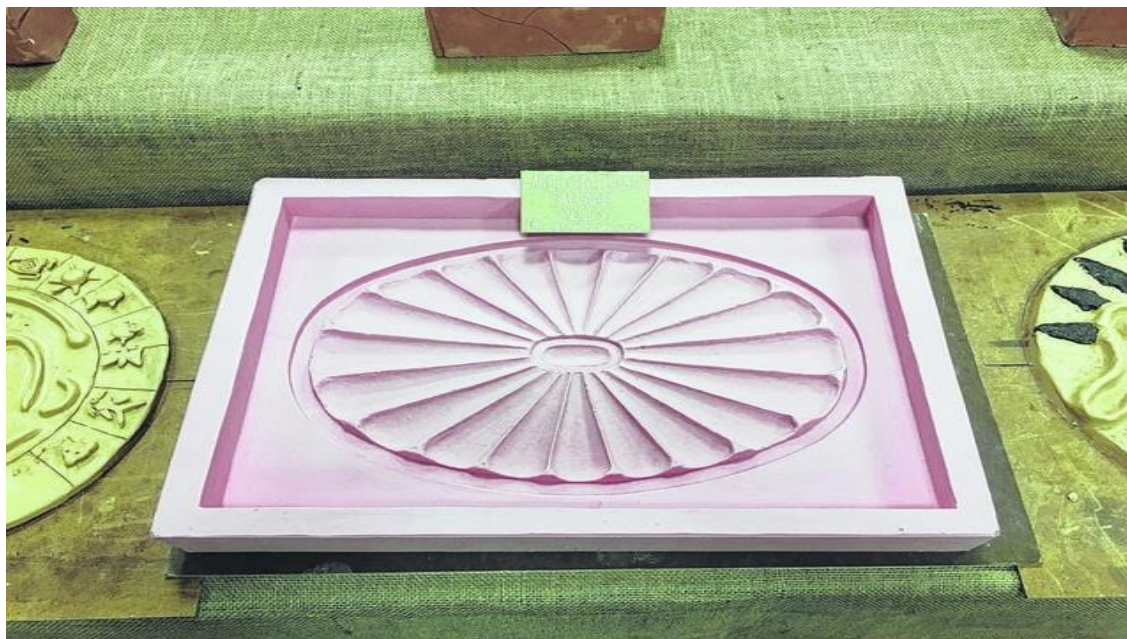
A silicone mold of architectural salvage from old buildings in Portsmouth. These pieces will be used in the design of new structures and sculptures for the garden.