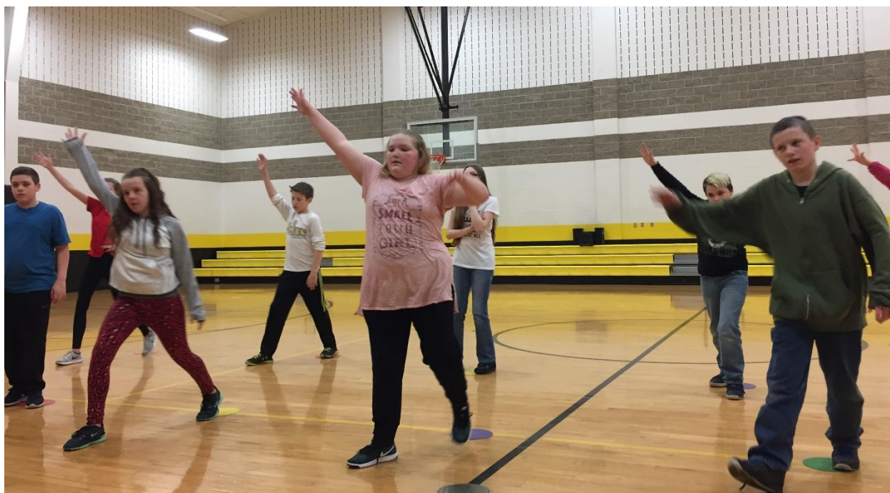
Sidney Middle School Students learning a dance.