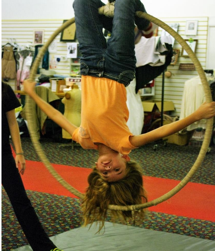
Western Local 4 th grader demonstrating acrobatic skills