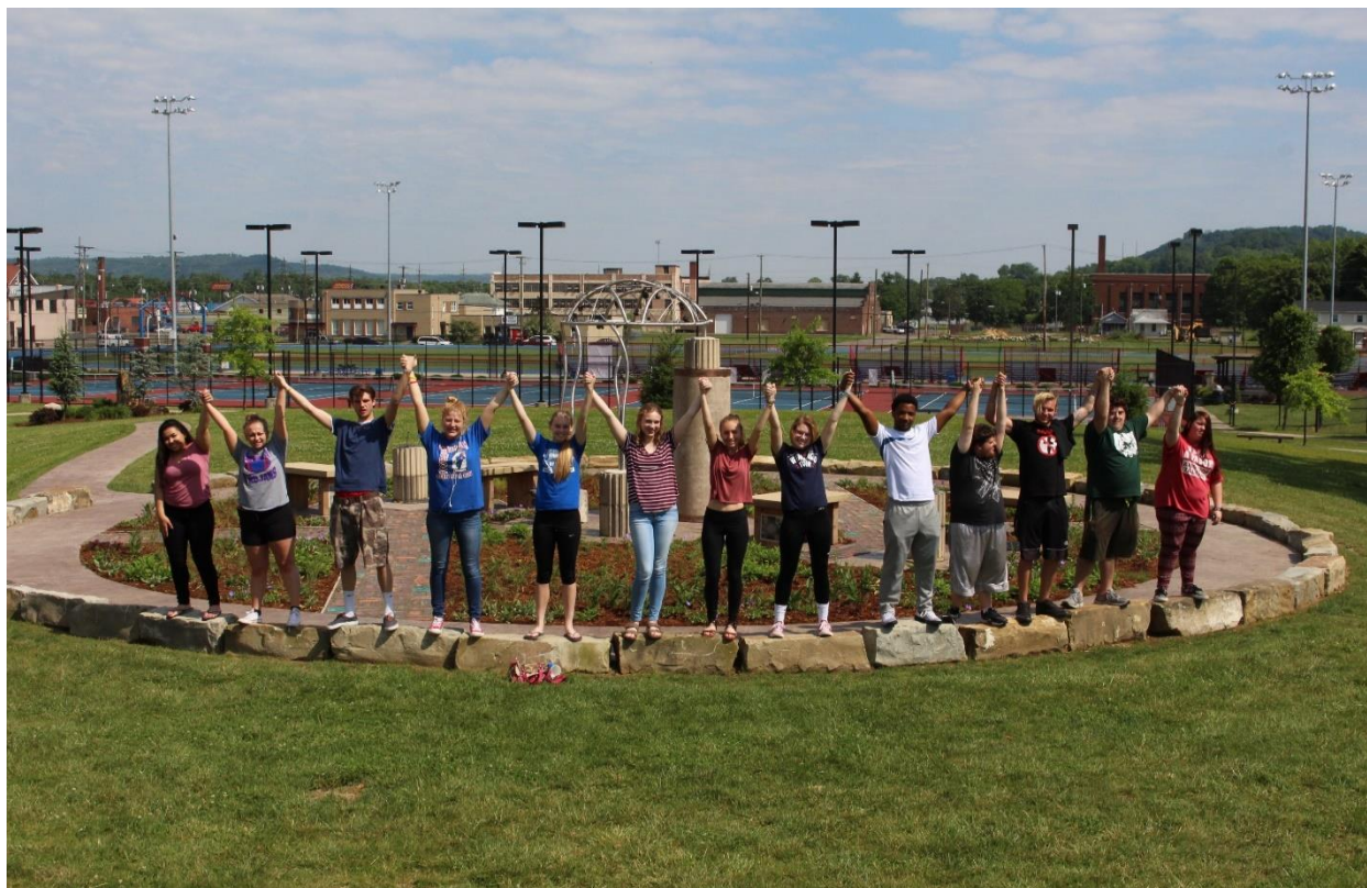
Portsmouth students celebrate bringing the Human Rights Garden to life.