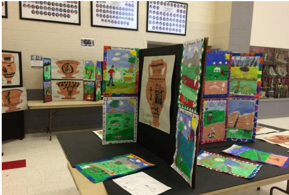
Triad Elementary School Art Exhibition