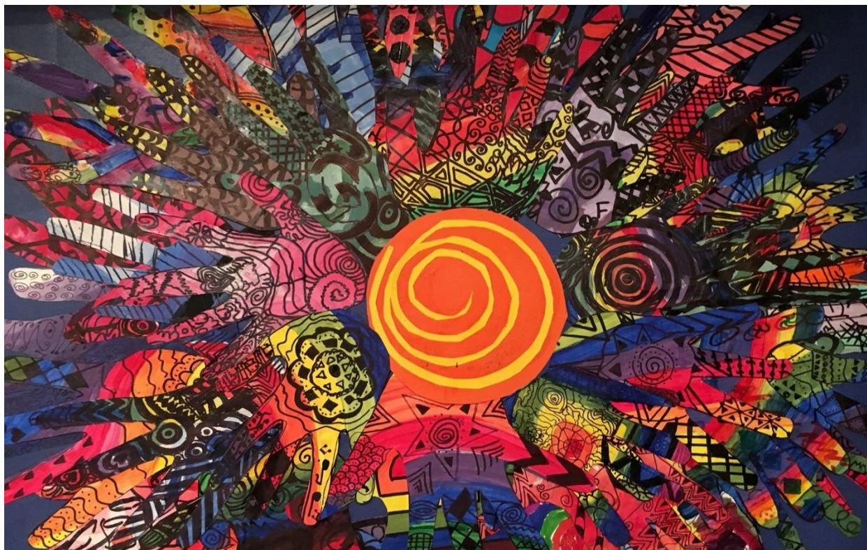
Graham Elementary Students leave their hand prints