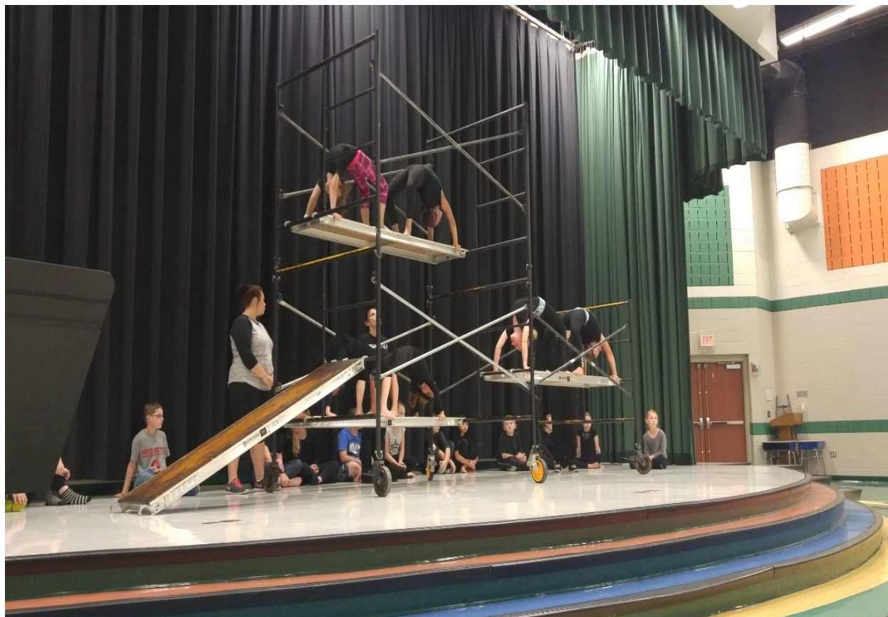
Acrobatics and Movement, Southern Ohio Museum teaching artists