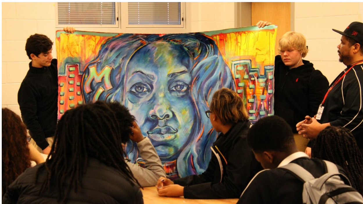
Whitehall Yearling students critique a painting.