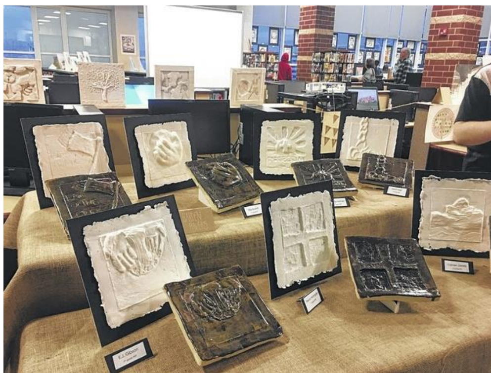
Paper casting and tiles created by students.