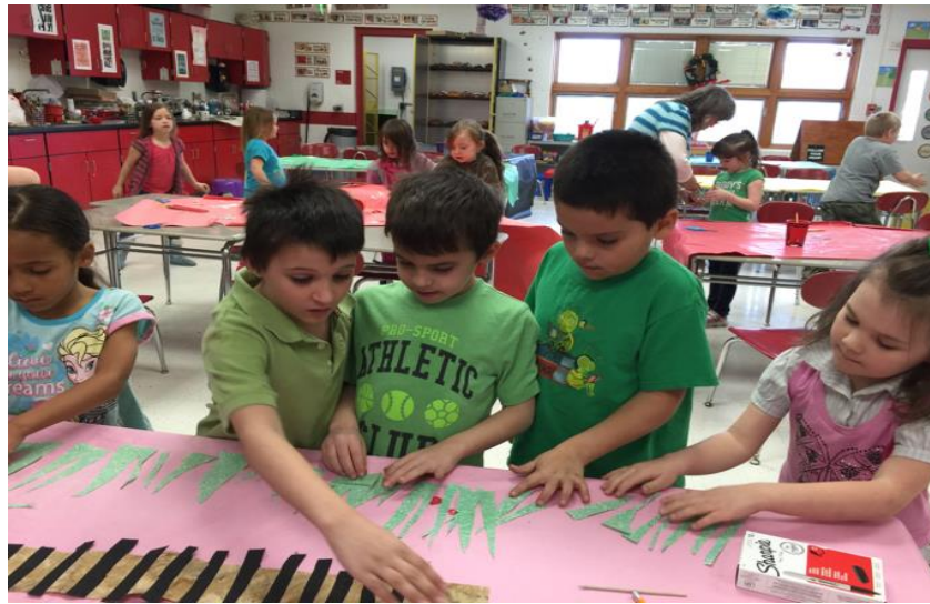
Students working on a quilt. Completed McKinley quilt below.

The artist spent one day a week at Garfield and one day a week at McKinley. She worked with a select group of art club students from grades 3, 4 and 5 as well as one class each of students across grades 1 - 5 one day a week for a semester. Students created individual projects in fiber arts as well as group quilts based on local history and fairy tales. At the end of the project, the Garfield quilt was presented by the artist to the school during a scheduled assembly. The McKinley quilt was shared with the Board of Education by the building staff.