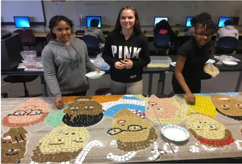
GJWMS Students work on the Faces of GJW. Detail below.