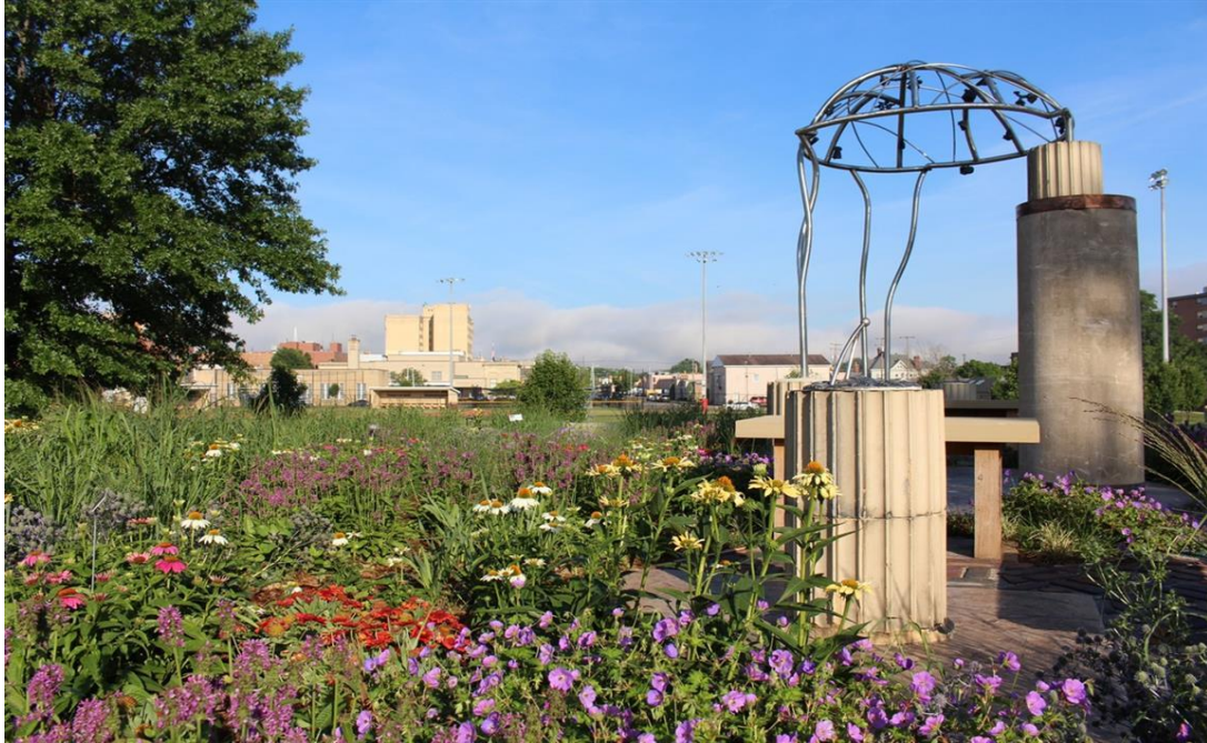
A view from the Human Rights garden.