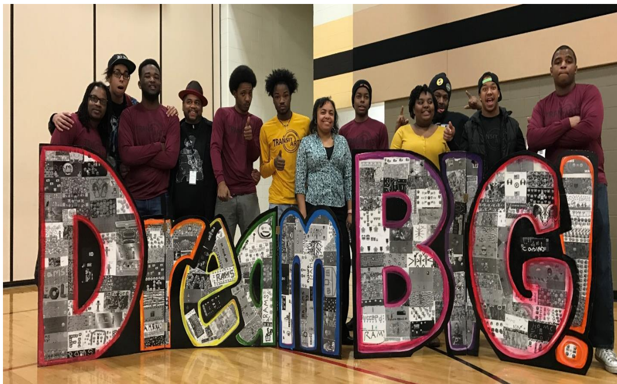
Rosemore Middle School students dream big.