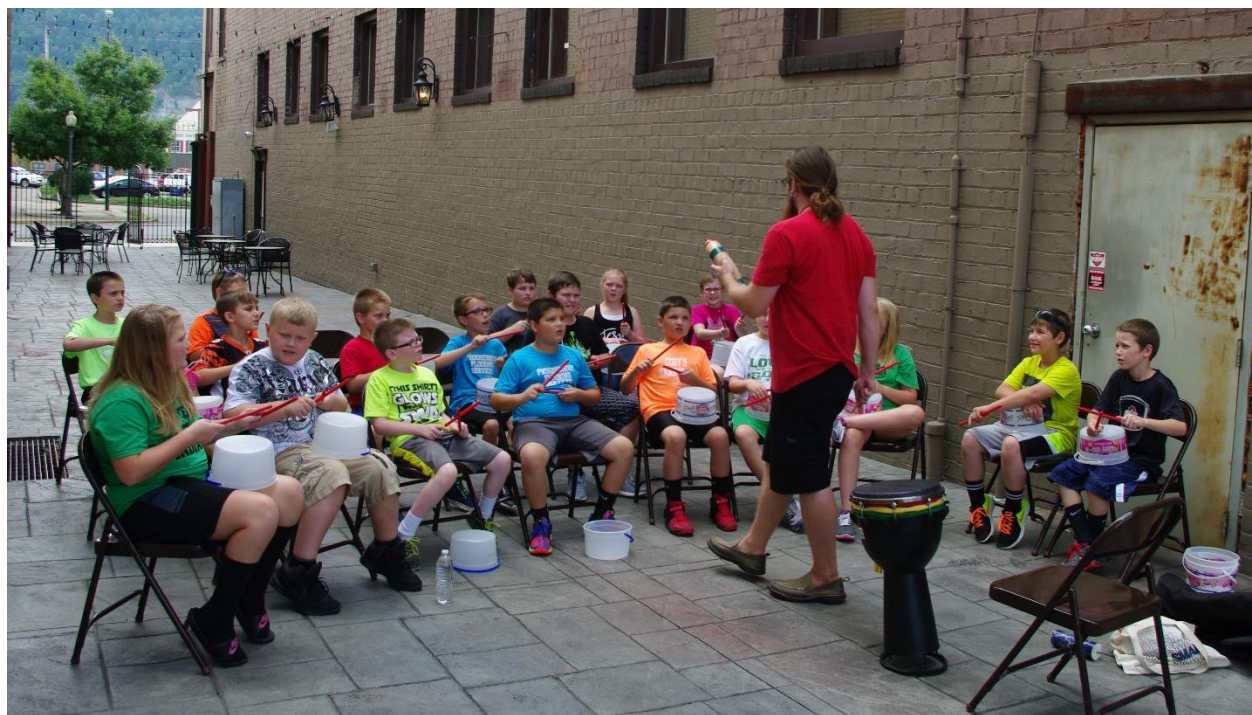
Western Local Elementary Students learning drumming.