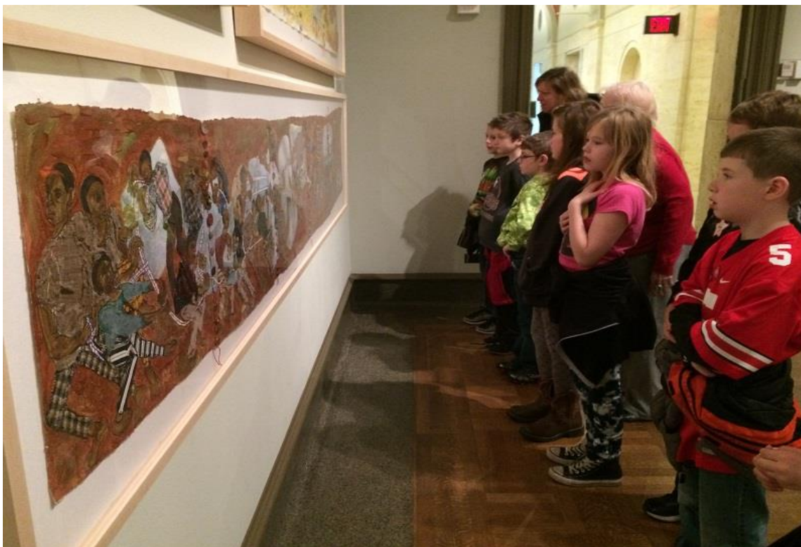
Triad Elementary Field Trip to the Columbus Museum of Art