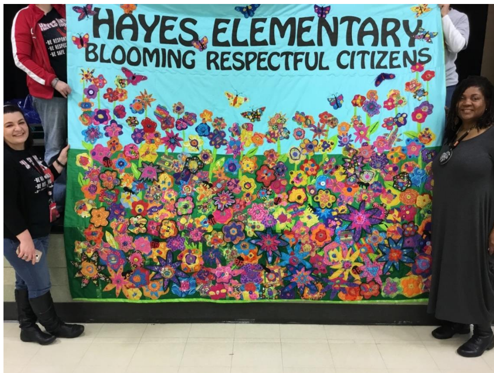
Hayes Elementary Quilt