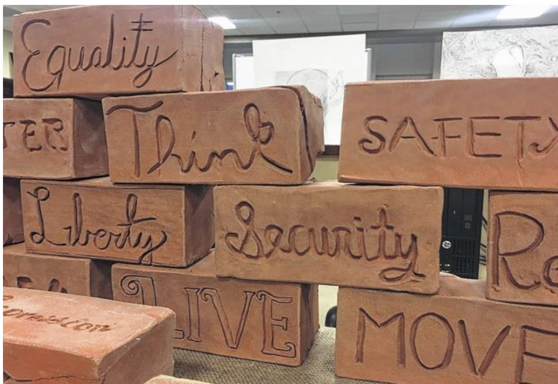
Bricks engraved with words related to the theme of Human Rights to be used throughout the garden path.

Building and Maintenance students designed and built benches for the space.