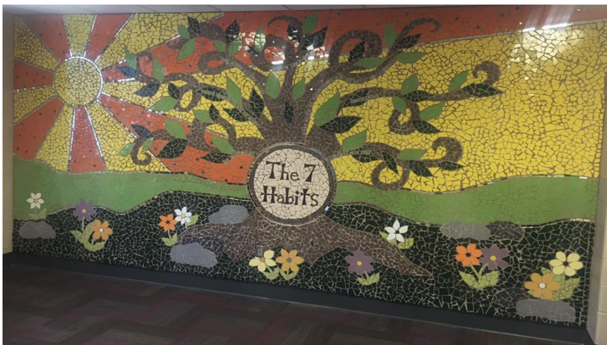
Mosaic Mural Bucyrus Elementary School