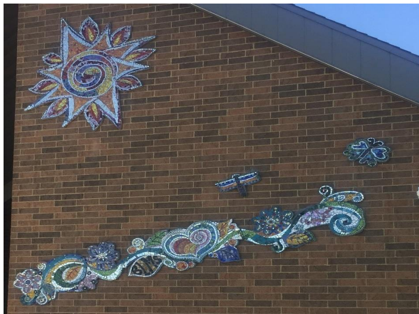
Detail, Exterior glass & mirror Mosaic Benjamin Local Middle School