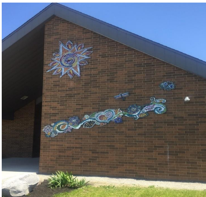
Entrance, Benjamin Logan Middle School