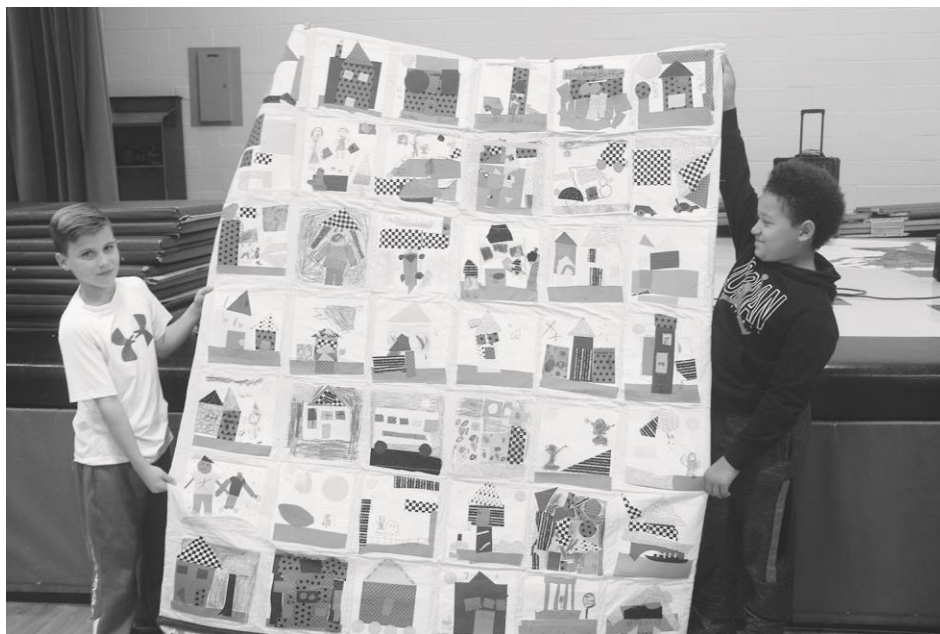
George Washington Elementary in Marion Quilt