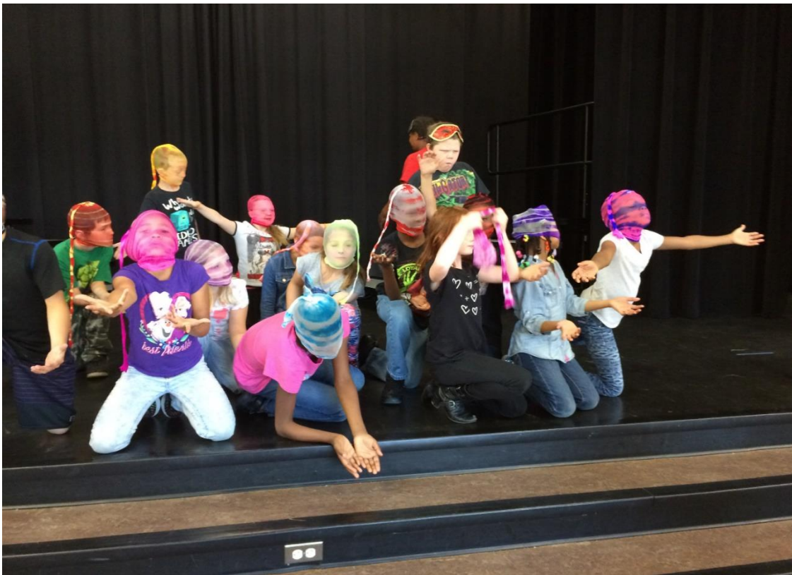
Performance, developed and performed by Starling students

All involved were appreciative of the ongoing support of the Ohio Arts Council, their vision, and for “doing something about it.”