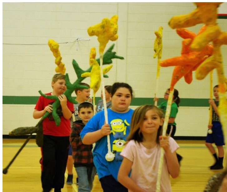
Culminating student performance at Western Local Elementary School