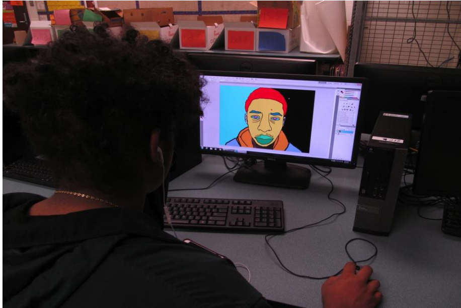
Winton Woods Digital Photography Student