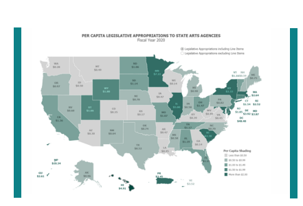
State Arts Agency Revenue <u>Explorers</u>

Get more information about public investments in the arts—and the returns on those investments—in your state: