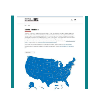
National Endowment for the Arts Fact Sheets