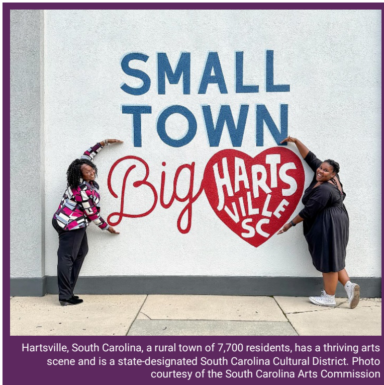
Hartsville, South Carolina, a rural town of 7,700 residents, has a thriving arts scene and is a state-designated South Carolina Cultural District.

The arts facilitate good health. The arts are increasingly used in clinical settings to address physical and mental health conditions. Research shows that the arts can facilitate patient healing and reduce stress for caregiving teams. Arts participation also supports improved public health outcomes at the community level.