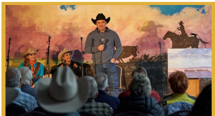
The National Cowboy Poetry Gathering is produced by the Western Folklife Center. Held in Elko, Nevada, the festival celebrates cowboy poetry, music and other Western traditions.